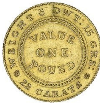
Back Adelaide Pound 1852