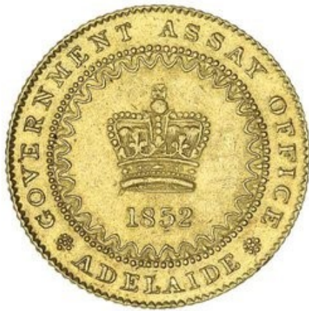
Front Adelaide Pound 1852