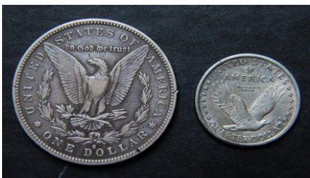
The two coins